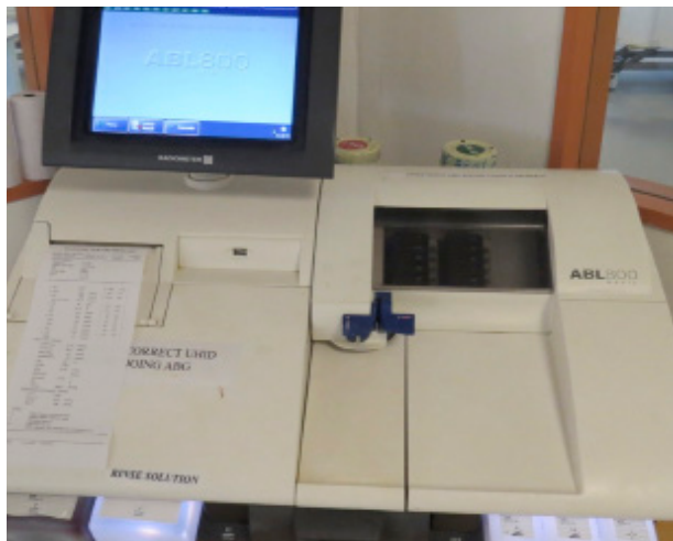
Figure 1. Arterial blood gas analysis machine.